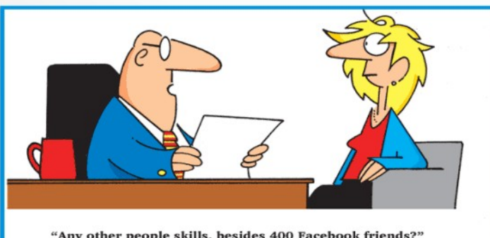
"Any other people skills, besides 400 Facebook friends?"

At Panacea, our Vision is to be the "Category Champion" for Retail Education in India. In many ways I feel, we are blessed as an organization. We have all the right ingredients and are destined to succeed and build not just a good & profitable company but a great company! We have a fantastic opportunity and the right platform.